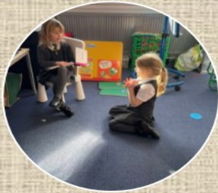
Curricular areas and subjects

At the heart of everything we do is our Catholic faith teaching. This encourages us to help shape and develop the God given talents of learners enabling them to realise their potential and motivate them to contribute to the wider world by serving others.