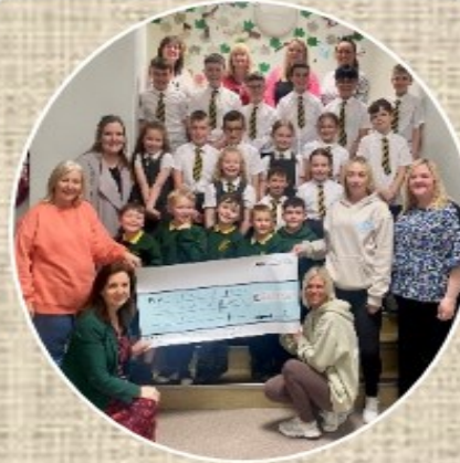
Ethos and Life of the School